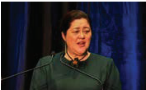
The Rt Hon. Governor General, Dame Cindy Kiro delivering her speech to the SPC23 delegates

I also know, during those periods, the huge strain that was placed on laboratories and their staff – doing work that was so important, but so often unacknowledged – while also under such